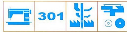
GC20698-2 长臂型综合送料厚料双针平缝机

This model is derived from GC20618. The long arm flat bed gives a wider working space. The presser foot can be lifted manually or by foot treadle. The bobbin winder on top and in middle of the machine head makes the sewing operation very easy. It features smooth machine running, low noise and machine durability, available for stitching car covers, car seats, safety belts, tents, parachutes, gliding parachutes, sails and other large workpiece. GC20698-1/-2 Single needle / Twin-needle long arm heavy duty compound feed lockstitcher. GC20698-1D/-2D Single needle / Twin-needle long arm heavy duty compound feed lockstitcher with auto thread trimmer. GC20698-1L/-2L Single needle / Twin-needle long arm heavy duty compound feed lockstitcher (Pneumatic footlifter).